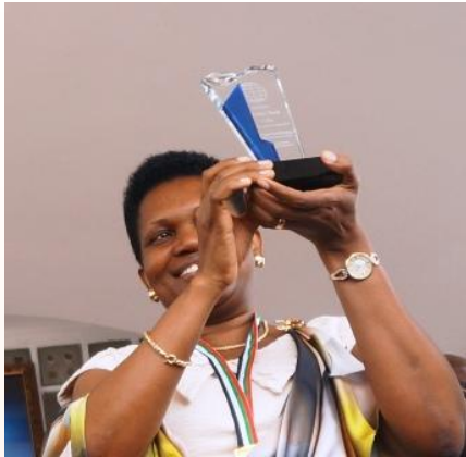
H.E. Rev. Denise Bucumi NKURUNZIZA The First Lady of BURUNDI Founder & Chairlady of BUNTU Foundation

Her Excellency Mrs. Denise NKURUNZIZA, First Lady of the Republic of Burundi and Founder & Chairlady of BUNTU Foundation was born at Gatsinda, Mwumba District of Ngozi province in the northern part of Burundi on December 1 st 1969. She did her primary school education at Gatsinda Primary School and the first four years of high school at Busiga in her home region to complete the last four years at ENEFA Kibumbu (Ecole Normal d'Education Familiale/Family Economy Education School), Mwaro province, in the central region of Burundi; now finishing her BA Program in Theology at Hope Africa University of Bujumbura.