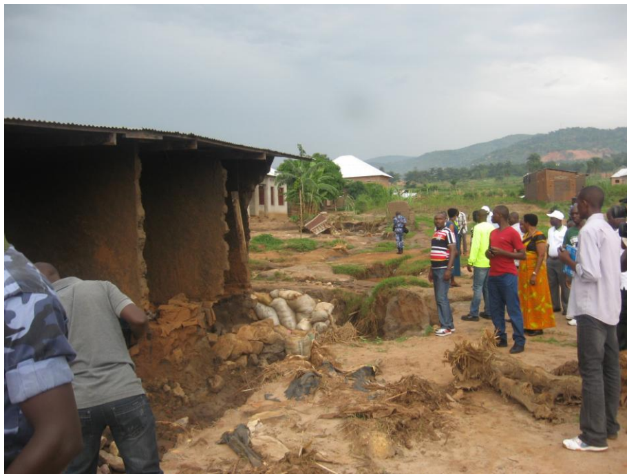
Effects of the February 9 th 2014 heavy rains at Gatunguru, Bujumbura province