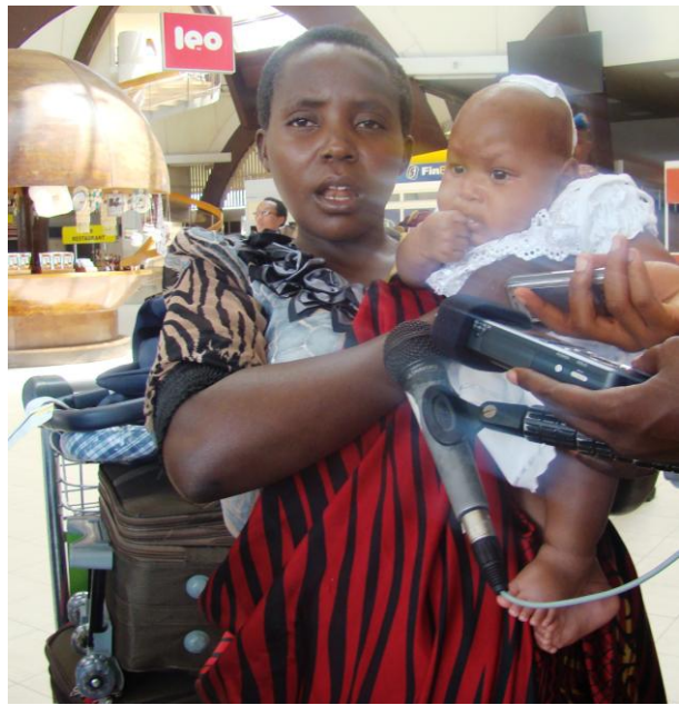
Baby Goreth from India Bujumbura, April 26 th 2011