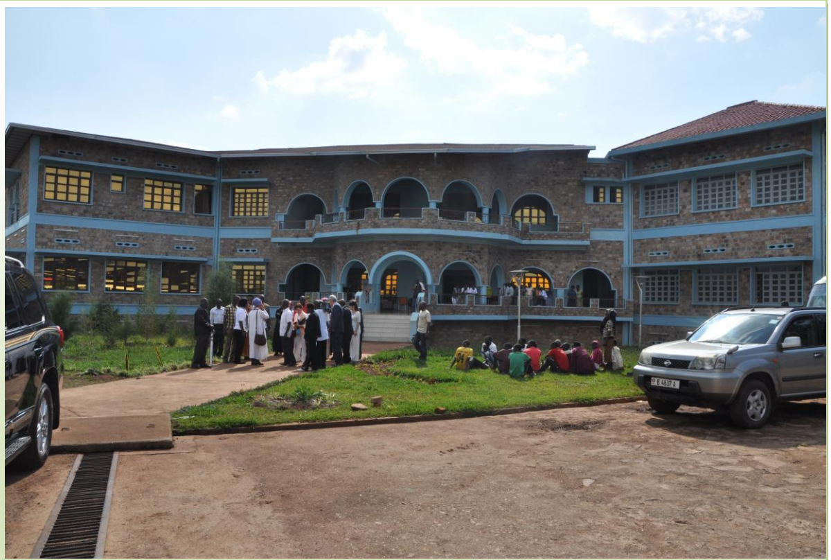
BUNTU Professional Training Centre (Hotel management & Tourism, Tailoring, Literacy, etc.)

The foundation strategically initiated professional training at a progressive pace to equip the orphans and widows with technical and soft skills which enable them to run small scaled businesses for the betterment of their families. Herein, the aim was to help those who graduate (from professional training and universities) to be organized into associations of solidarity groups and accompany them with a seed fund launching them into the community of business according to their domain of interest