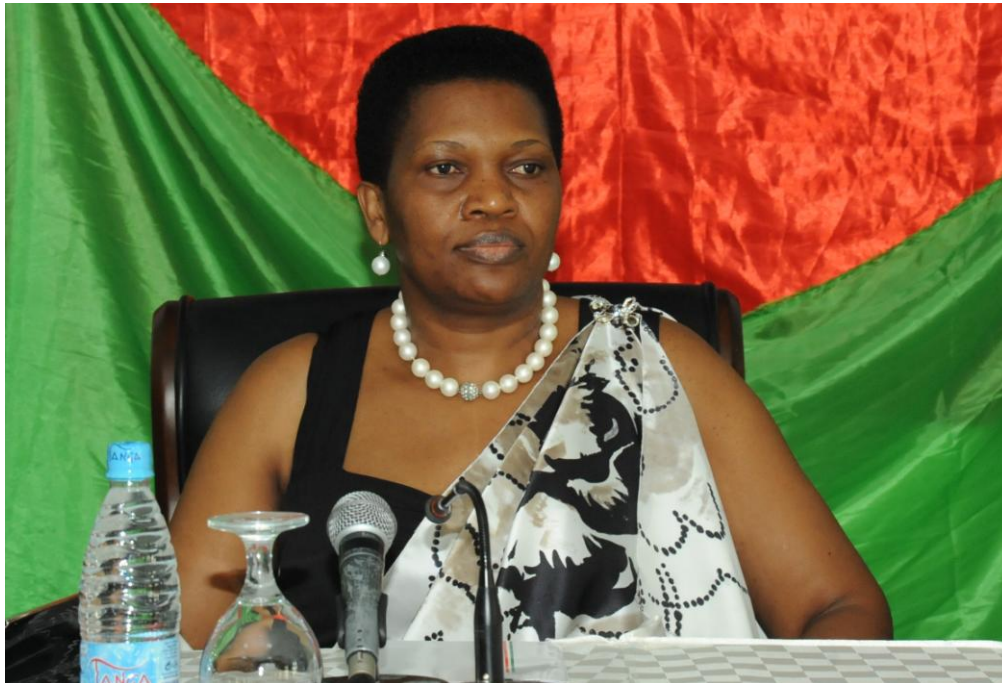
H.E. Rev. Denise Bucumi NKURUNZIZA The First Lady of BURUNDI Founder & Chairlady of BUNTU Foundation