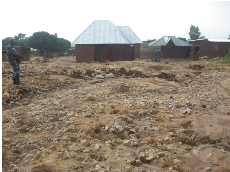
Effects of the February 9 th 2014 heavy rains at Gatunguru, Bujumbura province