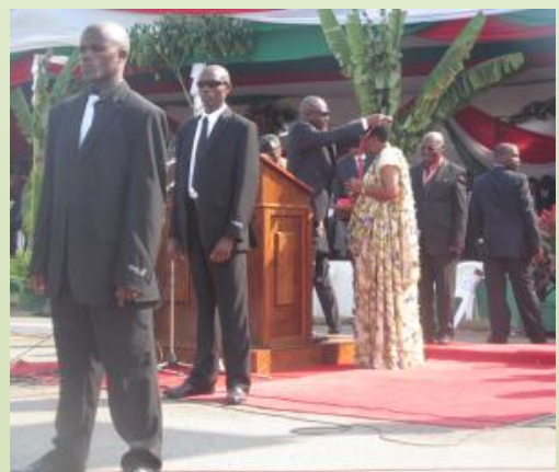
Awarded by the Government of Burundi Bujumbura, July 1 st 2013