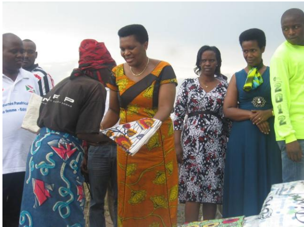
BUNTU Foundation Team at Gatunguru, Bujumbura province