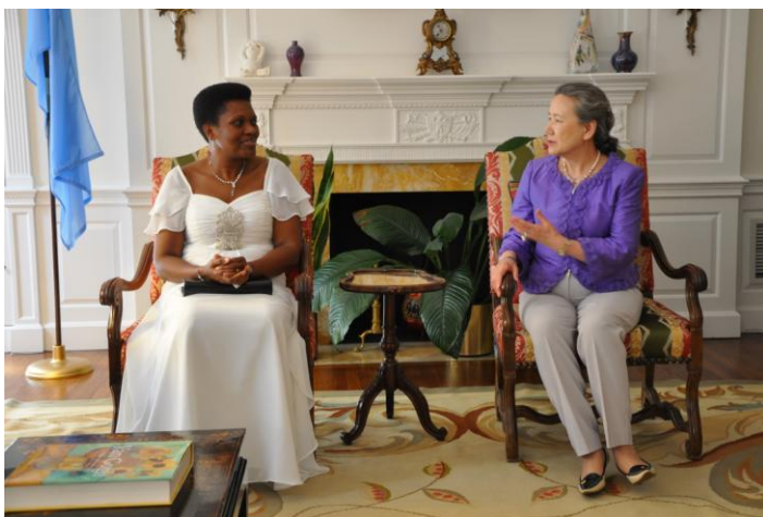
H.E. Mrs. Ban Soon-taek the Spouse of H.E. Ban Ki-Moon the General Secretary of the United Nations appreciates the work of H.E. Rev. Denise NKURUNZIZA for orphans through BUNTU Foundation New York, June 12 th 2013

He was nursed and educated at the Presidential Residence. His mother was treated at the Neuro-Psychiatric Centre of Kamenge in Bujumbura with the help of Rev. Denise. Now, she is healthy, back to Rwanda and remarried.