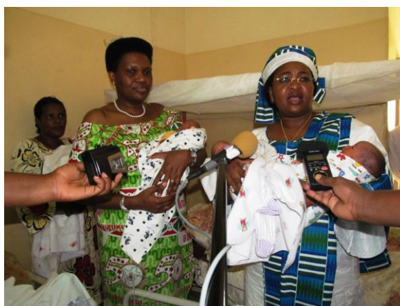
Theirs Excellencies Rev. Denise NKURUNZIZA and Mrs. Salma KIKWETE greeting triplets babies at Hopital Militaire de Kamenge Bujumbura City, July 3 rd 2012