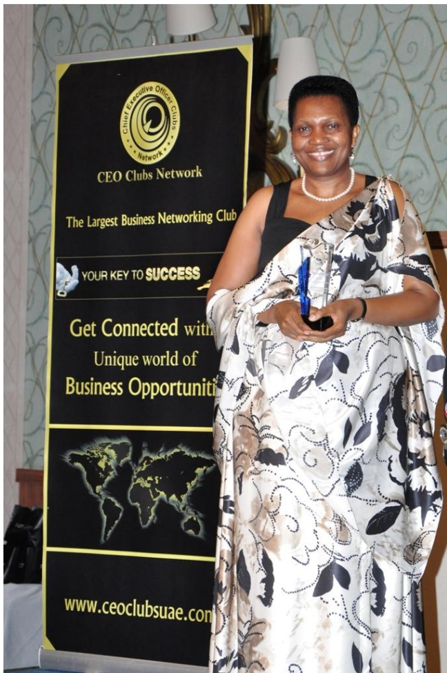
Women Leadership Inspirational Award Centre for Economic and Leadership Development & CEO Clubs