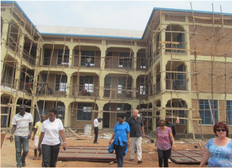
The extension of BUNTU Professional Training Centre

The foundation strategically initiated professional training at a progressive pace to equip the orphans and widows with technical and soft skills which enable them to run small scaled businesses for the betterment of their families. Herein, the aim was to help those who graduate (from professional training and universities) to be organized into associations of solidarity groups and accompany them with a seed fund launching them into the community of business according to their domain of interest