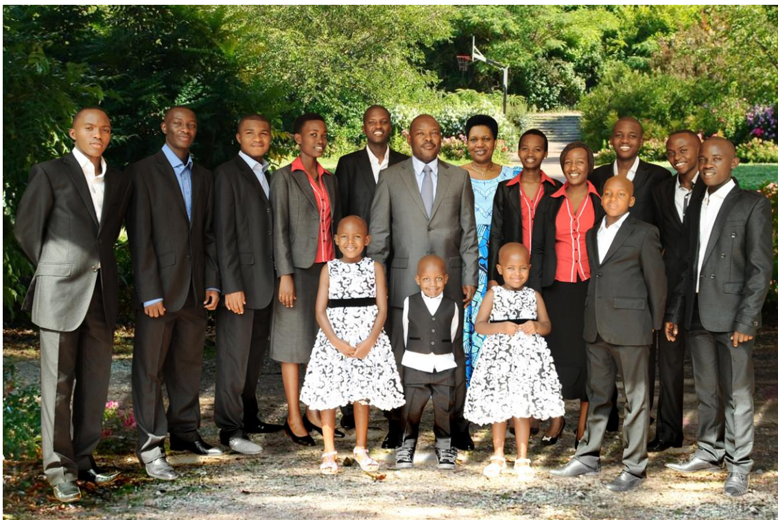
The Presidential Family together with some of the Orphans

BUNTU Foundation is a philanthropic organization. It was created in November 2005 to be legally registered by the Government in December the same year known as Fondation BUNTU (in French). Since the number of orphans and widows was too big, this foundation was established with the aim of assisting as many orphans as possible.