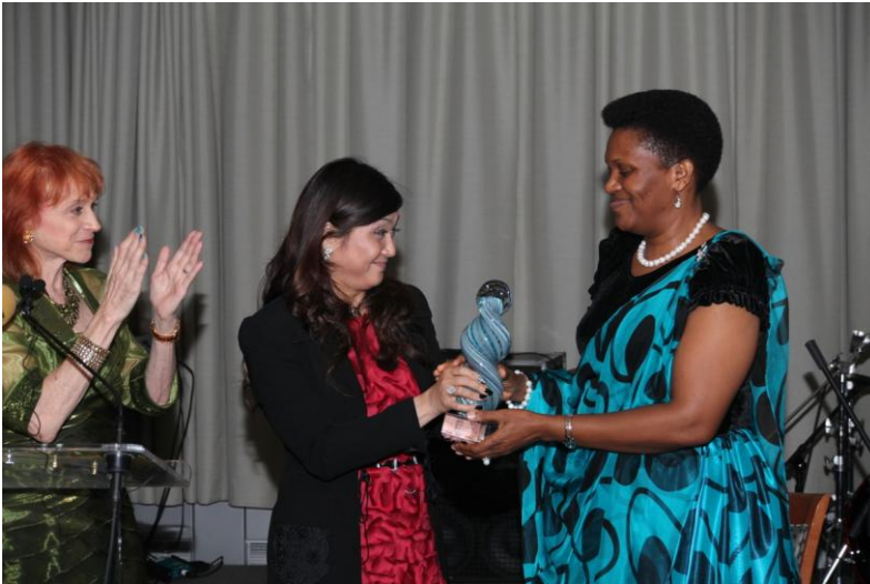
The Millennium Development Goals: 2013 Women's Progress Award by Voices of African Mothers and Associates New York, UN Headquarters, June 13 th 2013

The International Community, the Government of Burundi and the People of Burundi appreciate the accomplishments of BUNTU Foundation.