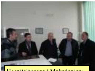
Hospitalsbesøg i Makedonien/ Hospital visit in Macedonia.

Yet another six months with significant progress, but also with unforeseeable difficulties because of a change in administrator of the Genbrug til Syd (Recycling for the South) program. This has been highly time-demanding and reduced our donations or increased transport costs. The difficulties are, however, expected to be solved, and in the long run strengthen Global Medical Aid.