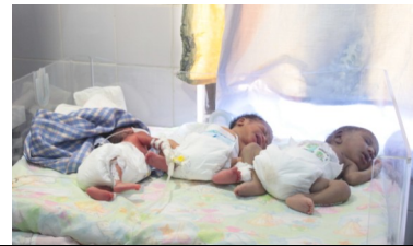
For tidligt fødte i Benin/ Premature newborns in Benin.

Therefore it is without question extremely important that further funds are procured. This is also needed because of the increase in activities, and the subsequent increase in costs.