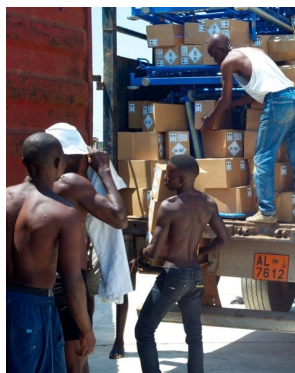
Modtagelse af medicin i Benin/ Receipt of medicine in Benin

Medieomtale: Global Medical Aid er blevet mere kendt i offentligheden, bl. a. som følge af nomineringen til Årets Helt.