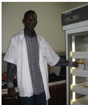
Hospitalsansat ved blodbank på hospital i Burkina Faso/ Hospital worker at blood bank in hospital in Burkina Faso

de stærkt stigende aktiviteter og deraf følgende udgifter.