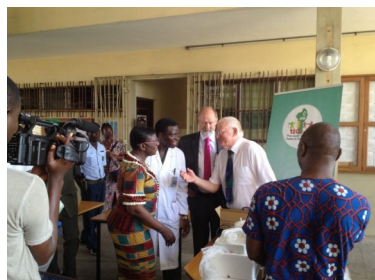
Overdragelsesceremoni med Benins Sundhedsminister/ Hand-over ceremony with Benin's Health minister.

Intet doneret – vi forsøger at finde ny samarbejdspartner